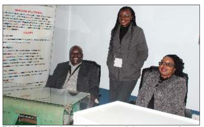
RMS staff members who manned the company's stand at ZITF