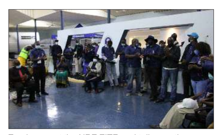
Employees at the NRZ ZITF cocktail reception