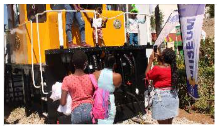
The NRZ stand was a favourite for selfies