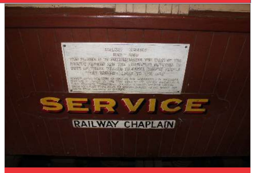
The Railway Chaplain's caboose now at the NRZ Museum

The growth of the Anglican Communion in Victoria Falls and the country at large is synonymous with the growth of the railways. For its role, the NRZ was conferred the Inkanyiso yoMondli Award together with the Victoria Falls Hotel for their contribution to the growth of the church. A chapel was set up at Victoria Falls Hotel in 1932 which was owned by the then Rhodesia Railways. The chapel which can accommodate 30 people was dedicated by the previous Bishop pf Southern